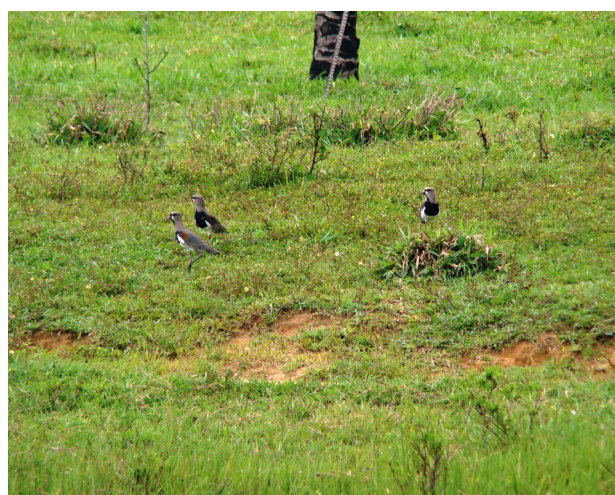
Figure 2. Individuals of southern lapwing, Vanellus chilensis in a pasture in the study area in Sena Madureira, Acre, Brazil. This figure is in color in the electronic version.

Individuals of V. chilensis were first observed in a group of approximately 16 birds in an area of pasture near local residences (Figure 2). These individuals were captured using five mist nets. The nets were set at 5:00 am and closed at